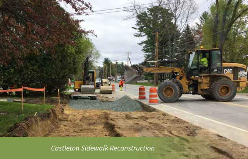
Castleton Sidewalk Reconstruction