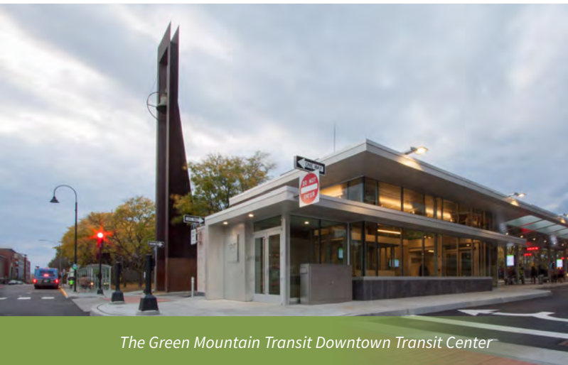
The Green Mountain Transit Downtown Transit Center

VHB led a team of professionals in civil engineering, architecture, mechanical engineering, electrical engineering, structural engineering, security, and traffic engineering to deliver the project on time and under budget. The project was also designed in close coordination with Burlington Public Works, and Burlington Electric Department to make sure the facility was carefully and thoughtfully integrated with the Burlington Downtown area in accordance with state and local accessibility requirements. VHB also provided construction phase engineering support to GMT including delivering a smooth ride from project conception to grand opening and full operation.