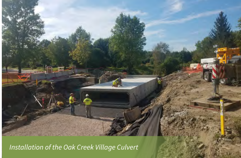
Installation of the Oak Creek Village Culvert