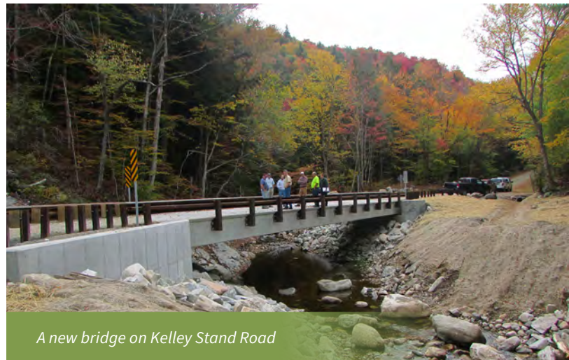
A new bridge on Kelley Stand Road

For this project VHB provided project scoping, design services, and full construction oversight for reconstruction of approximately four miles of Kelley Stand Road (Forest Highway 6) and reconstruction