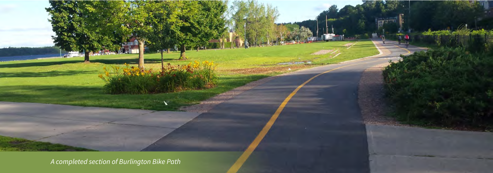
A completed section of Burlington Bike Path

along sections of Roaring Branch stream channel located in Sunderland, Vermont. Project scope included reconstruction of 32 damaged sites along to the road, including two bridges, multiple roadway sections, and channel reconstruction.